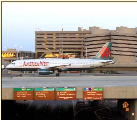
Sky Harbor International Airport