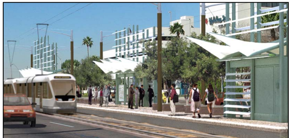
A rendering of the Washington Street/44th Street Station looking west