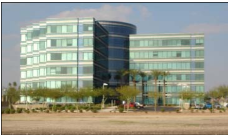
Desert Schools FCU Building

Source: 2000 census (1/2 mile radius or 10 min. walk from station)